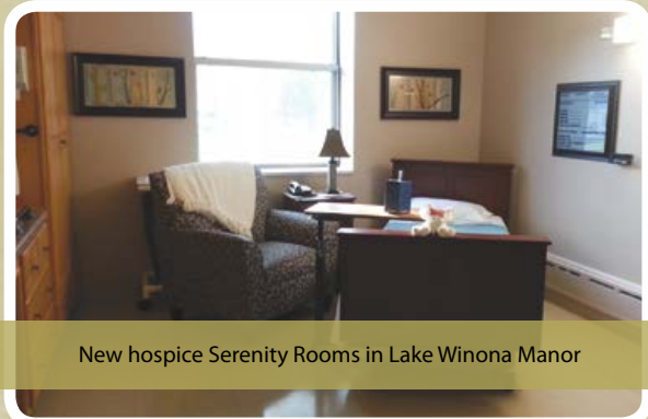
New hospice Serenity Rooms in Lake Winona Manor

Hospice opened five Serenity Rooms in Lake Winona Manor to enhance the comfort of individuals at the end of life and to provide a more comforting, private environment for their families.