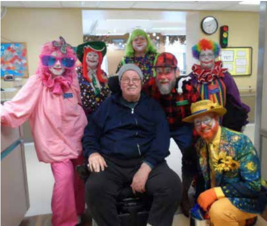
#55: Laughter heals: Laughter! Send in the clowns! The Winona Area Clown Club stops by Lake Winona Manor to share some laughs and smiles! They're also attendees of our annual Lake Winona Manor parade in June!