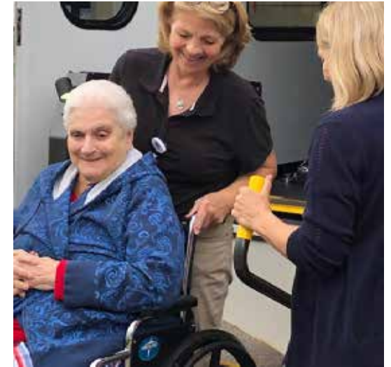
#58: Sharing memories A trip down memory lane on the Winona Health van. Everyone is enjoying the jaunt around town, navigating through their former neighborhoods, recalling memories and shared experiences of raising children, enjoying friends and even laughing about some of their early years when they had to find ways to "make ends meet."