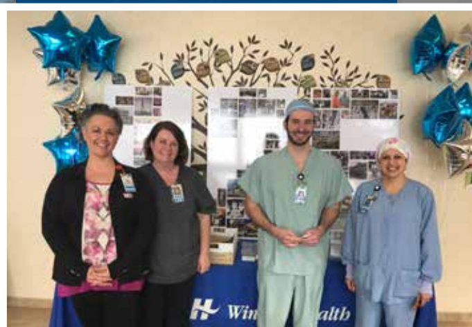
#20: Winona Health Day Staff from various departments greeted community members on Winona Health Day. We celebrated by sharing Kind granola bars and kindness cards with those who visited to celebrate the day.