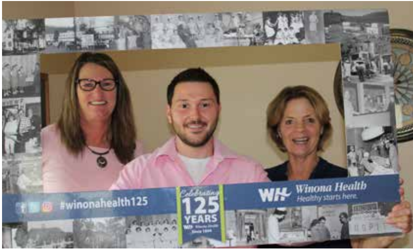
#53: Comfort and joy for our residents Our staff cares for each resident around the clock, every day, providing life-enriching care along with comfort and joy. With that, comes peace of mind for their families.