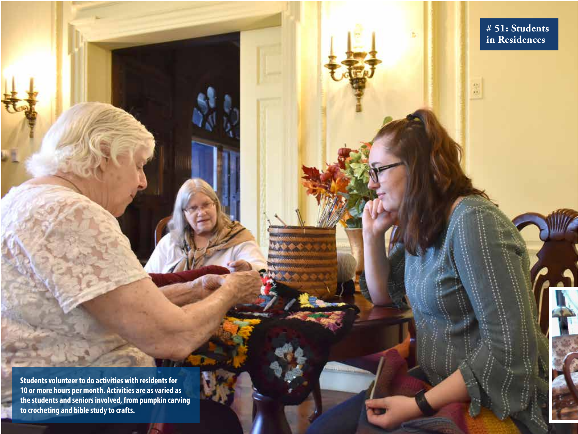
Students volunteer to do activities with residents for 10 or more hours per month. Activities are as varied as the students and seniors involved, from pumpkin carving to crocheting and bible study to crafts.