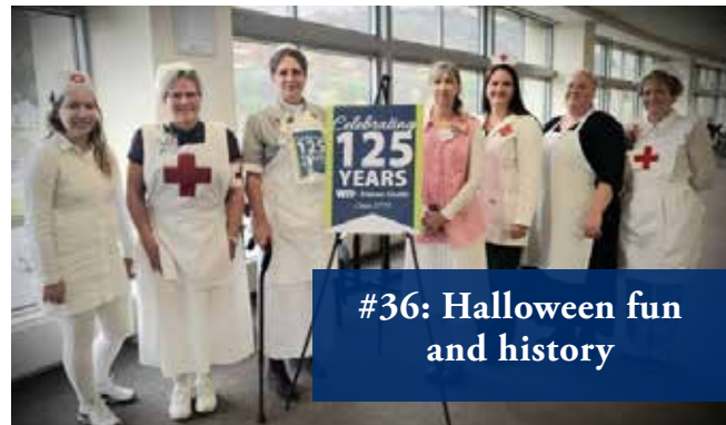
#36: Halloween fun and history