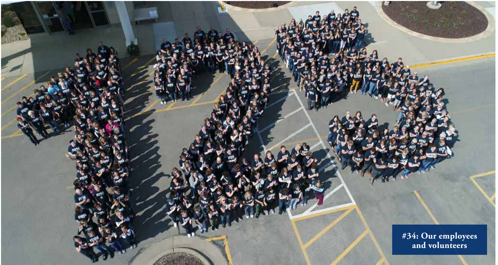
#34: Our employees and volunteers