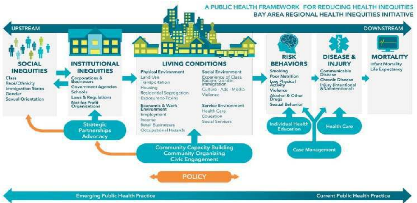
Figure 1 provides a visual of A Public Health Framework for Reducing Health Inequities, developed by the Bay Area Health Inequities Initiative.

More recently, the Christensen Institute has made the case for using the term drivers of health as a better way to describe social determinants of health. There are multiple competing definitions of social determinants of health, and the causal drivers of health outcomes are just that—drivers—not determinants that cannot be changed. As a result, we will refer to drivers of health throughout this document.